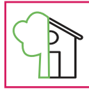
Indoor / Outdoor