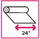
24" / 630 mm wide