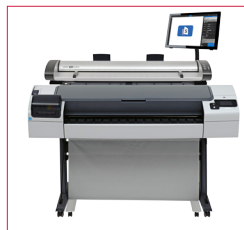
IQ Quattro 44 MFP Repro