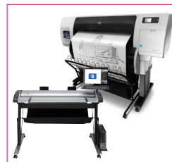
Low stand version available for side-by-side