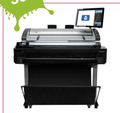
IQ Quattro 36 MFP Repro