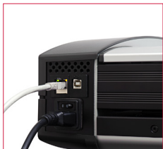
Copy to unlimited number of printers via network or USB