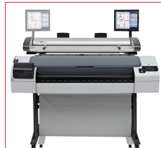
A good ergonomic environment for left- as well as right-handed operation