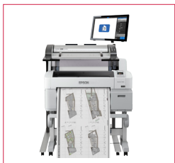
IQ Quattro 24 MFP Repro