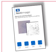
Awarded Nextimage software to ensure image quality for both archival and printing