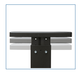
Height adjustable stand for optimal ergonomics